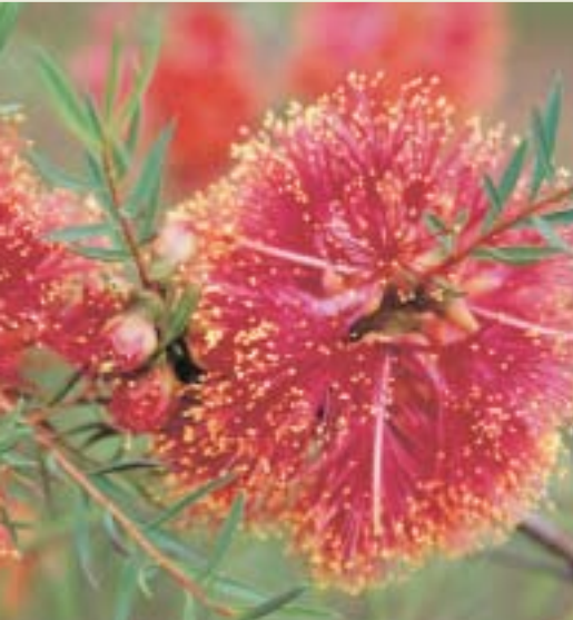
Melaleuca fulgens (scarlet honeymyrtle)