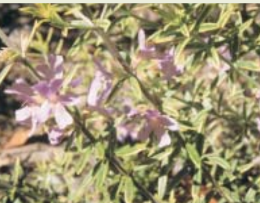
Westringia brevifolia 'Lilac and lace'

Plants prone to frost damage (where known) are indicated. The growth habit (form) is indicated by C (climber), GC (groundcover), P (perennial), S (shrub) and T (tree). Some plants fit into more than one category.