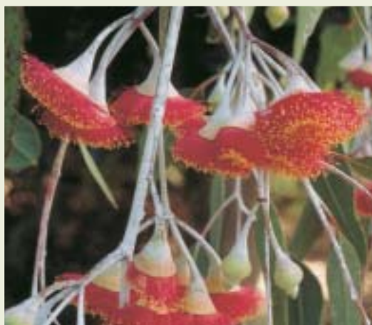
Eucalyptus caesia (silver princess)