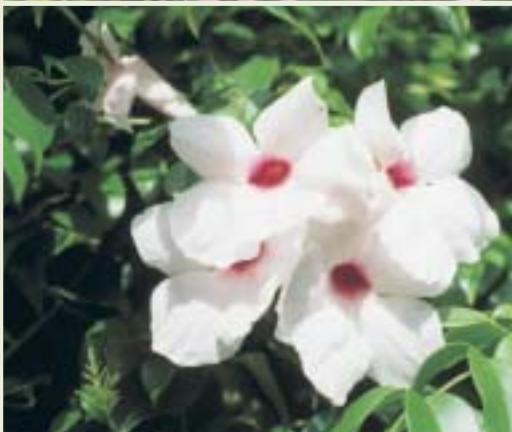
Pandorea jasminoides (native jasmine)