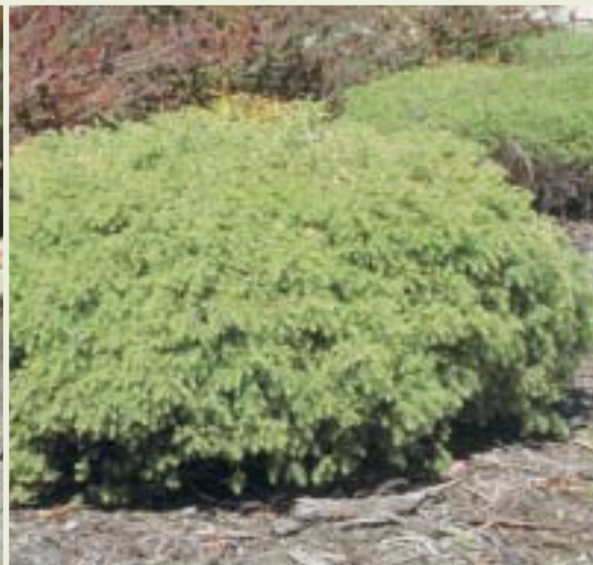
Melaleuca incana (grey honeymyrtle)