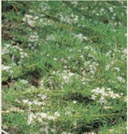
Myoporum parvifolium (creeping myoporum)