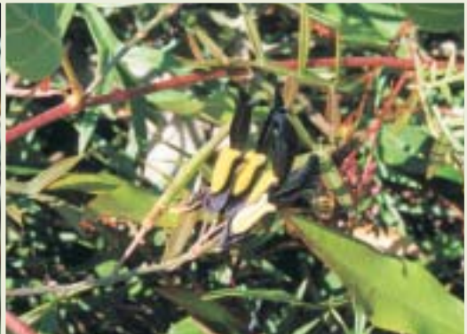
Kunzea pulchella (granite kunzea)