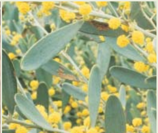
Acacia redolens (vanilla wattle)