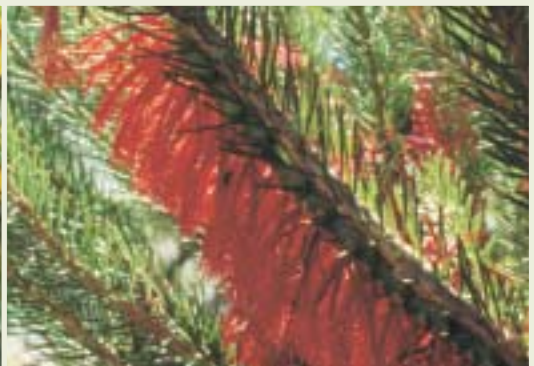
Calothamnus quadrifidus (one-sided bottlebrush)