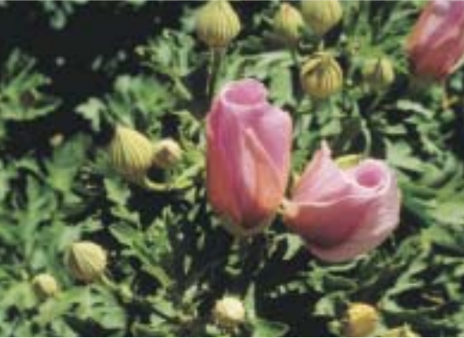
Alyogyne huegelii (lilac hibiscus)