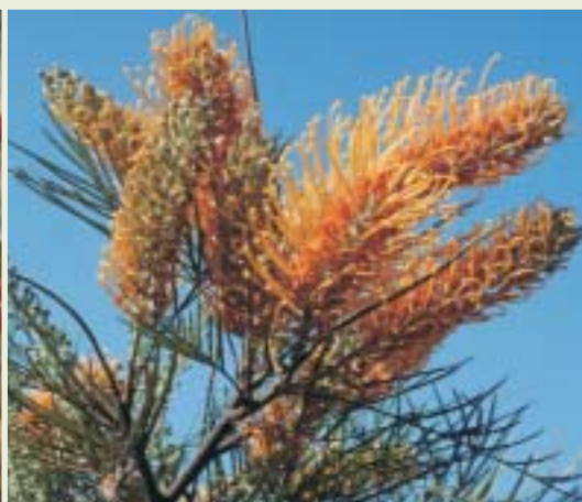
Grevillea 'Honey gem'