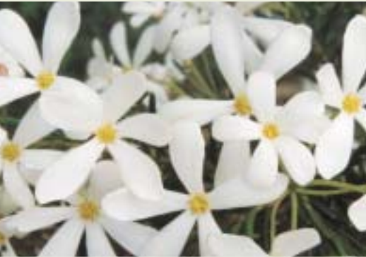
Ricinocarpos tuberculatus (wedding bush) Scaevola albida 'Mauve clusters' (fanflower)

These guidelines are for improved soils only, so it is important to consider the treatments mentioned in the previous section to get maximum benefit. Plants for non-improved soils may require more water than listed above. Any water restrictions over-ride this recommendation.