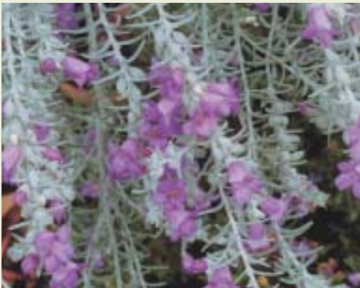
Eremophila nivea (silky eremophila)

All micro-irrigation systems should begin with a pressure or flow control device. If this is not installed the emitters may not work efficiently and the joints may burst under excess pressure. These vital components are often not on display at irrigation/hardware stores. Be sure to ask for one.