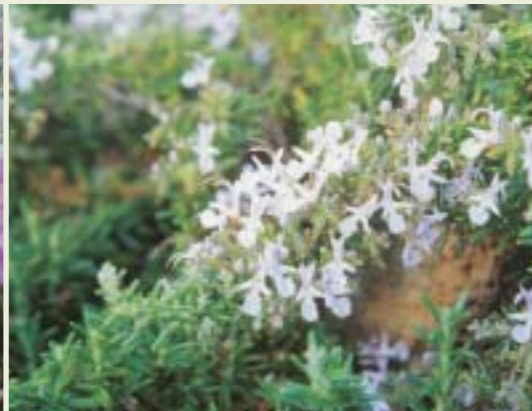
Rosmarinus officinalis (rosemary)