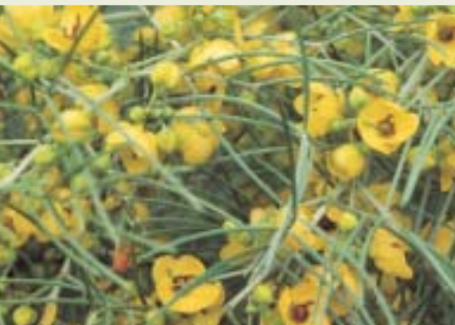
Senna artemisioides (silver cassia)

Ideally, water should be applied at a time of day that allows it to have soaked down into the root zone by the time the plant needs it most, in the heat of the day. In sandy soils where penetration is rapid, this means watering early in the morning, between dawn and 9 am. In heavier clay or loam soils the water takes a lot longer to soak in so it can be applied earlier, say from midnight to dawn. In both cases the water is applied at a time when evaporative loss is low. Once the sun comes up any moisture remaining on the surface will be quickly dried up.