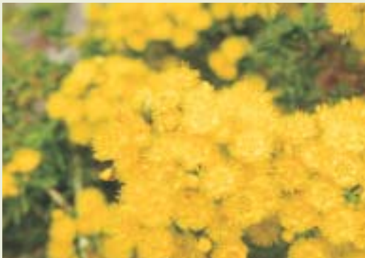
Verticordia chrysantha (golden featherflower)