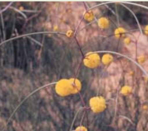
Acacia merinthophora (zig-zag wattle)

It is possible to create and enjoy beautiful gardens and parks while ensuring that your town also enjoys a long and healthy life. This booklet was compiled following a series of workshops and visits to five wheatbelt towns (Dowerin, Kellerberrin, Merredin, Narrogin and Wagin) and in conjunction with local gardeners, businesses and authorities.