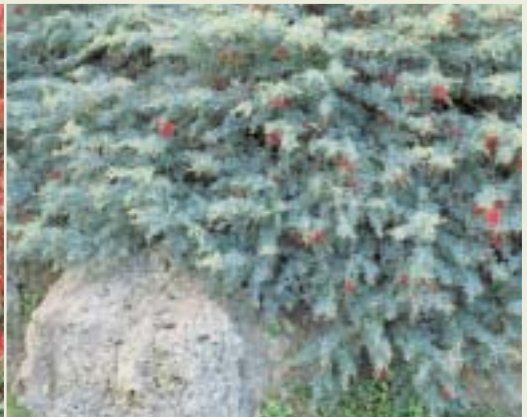
Grevillea thelmanniana (spider-net grevillea)