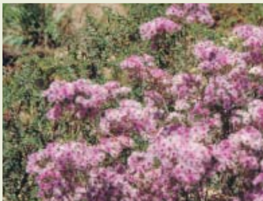
Verticordia monadelphae (pink woolly featherflower)