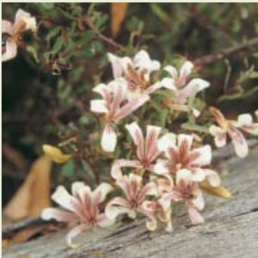
Marianthus bicolor (painted marianthus)

All warm season grasses have low growth rates in winter and all can be damaged by severe frosts. Cool season grasses are not recommended as they require lots of water.