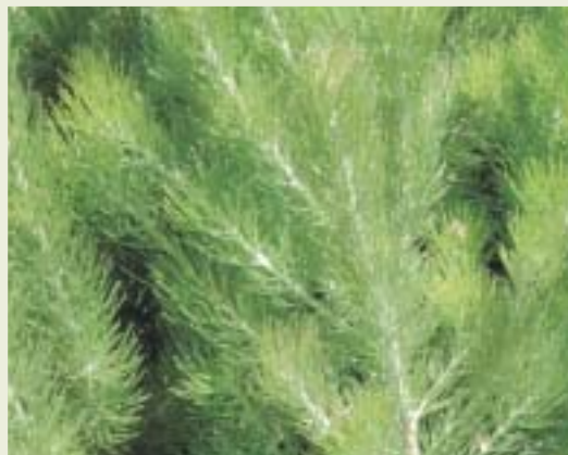
Adenanthos sericeus (Albany woollybush)