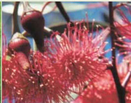
Eucalyptus erythronema (red-flowered mallee)