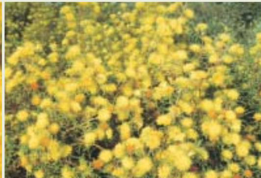
Dryandra polycephala (many-headed dryandra)