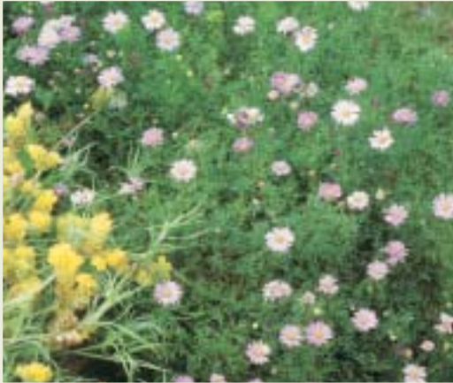
Brachyscome multifida (cut-leaf daisy)