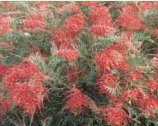
Grevillea 'Robyn Gordon'

For greatest benefit, with minimum effort, organic matter should be mixed through the top 30 cm of soil prior to planting. There is little advantage to be gained by mixing it deeper.