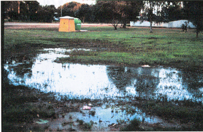
Photograph 3: Water ponds in many depressions all along the railway track