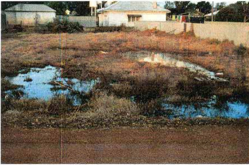
Photograph 5: Recreational areas west of the Gordon River and near the dam wall become stagnant pools in winter